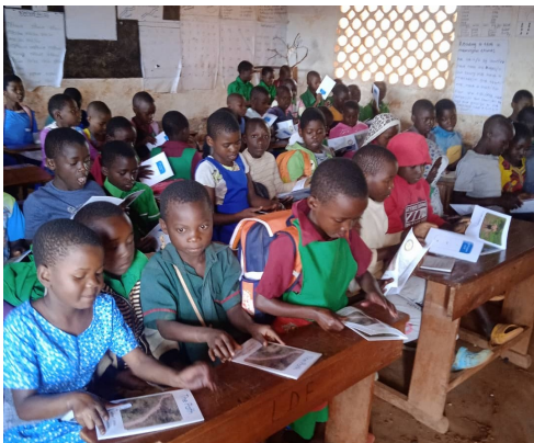
Typical Malawi classroom size of those who receive the books created by M.E.L.T.

First on the long “to do” list is to design, have built, and fill new bookshelves for the MELT Central Library. The Crane Cargo shipment has arrived and is going through the customs process after which the MELT Malawi team will get the 5 crates North from Lilongwe to Mzuzu to unpack at the library. It’s exciting to note title 30 has been published! That is 15,000 books in the hands of kids!! Malawiearlyliteracy.org